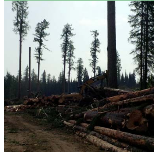
The audit visited active harvesting sites. Here a machine loads logs with retained veteran trees in the background.

Corrective action plans designed to address the root cause of the non-conformity identified during the audit have been developed by Atco and reviewed and approved by KPMG PRI. The next surveillance audit will include a follow-up assessment of these issues to confirm that the corrective action plans developed to address them have been implemented as required.